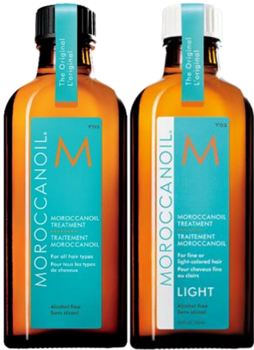
PREP MoroccanOil Treatment or Treatment Light