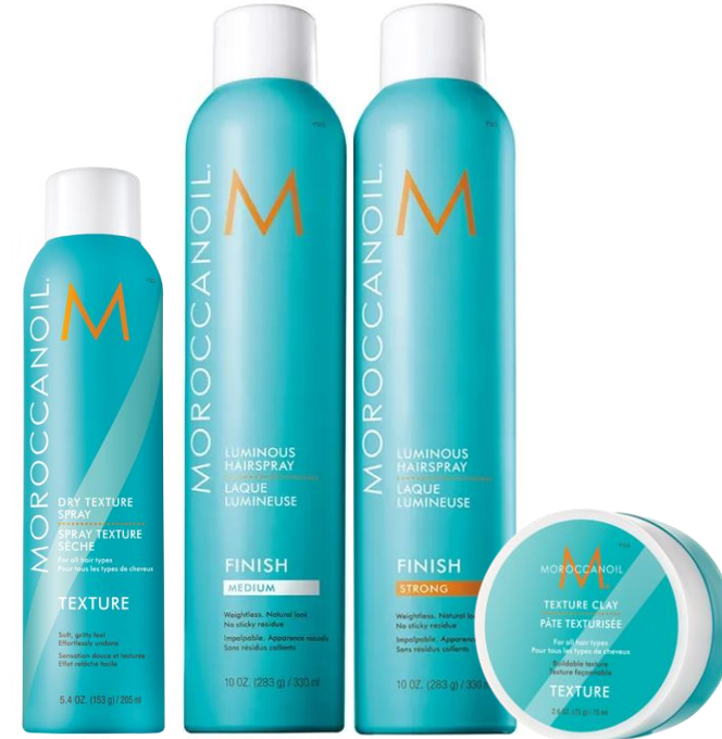
FINISH MoroccanOil Dry Texture Spray MoroccanOil Luminous Hairspray Strong & Medium MoroccanOil Texture Clay