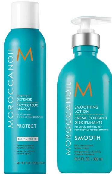
PRIME MoroccanOil Smoothing Lotion MoroccanOil Perfect Defense